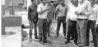
Civic chief Abhijit Bangar at one of the STPs along with officials.

The Navi Mumbai Municipal Corporation (NMMC) began trial runs to supply recycled water to industrial units from the tertiary level sewage treatment plant (STP) in Koparkhairane. The work on another tertiary level STP plant in Airoli is also in the final stage. Civic chief Abhijit Bangar has directed officials to start the actual supply within a month to the industrial units situated in the Trans Thane Creek (TTC) industrial area.