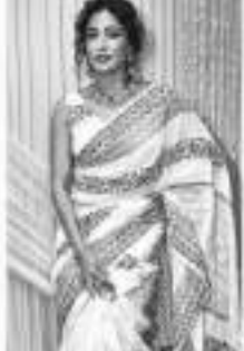
Bollywood actress Chitrangda Singh during a programme in New Delhi on Monday

Katrina Kai-Vicky Kaushal get threats MUMBAI: An unidentified person allegedly threatened Bollywood actor Katrina Kai and her husband Vicky Kaushal on a social media platform, a police official said on Monday. Kaushal complained to police that the person had threatened him and his wife on Instagram, the official said.