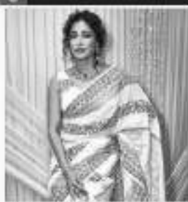
Bollywood actress Chitrangda Singh during a programme in New Delhi on Monday